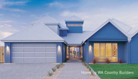
Home by WA Country Builders